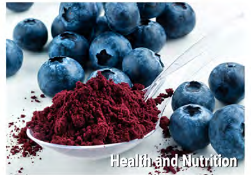
Health and Nutrition